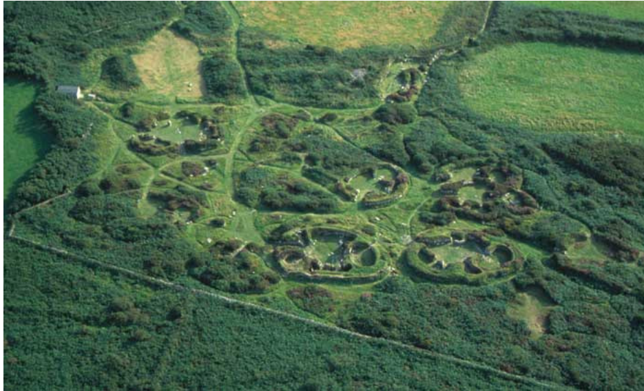
Courtyard house settlement at Chysauster, Madron.

The houses are oval or irregular in shape and are enclosed by a massive stone-faced earth bank two to three metres thick. Within this enclosure are several rooms joined together and arranged around a paved courtyard. The usual arrangement consists of a round or oval room opposite the courtyard entrance with a long room to its right. Excavation has shown that the round or oval rooms served as domestic areas, and the long rooms housed animals or were used for storage. Archaeologists are uncertain whether the courtyards were roofed or not.