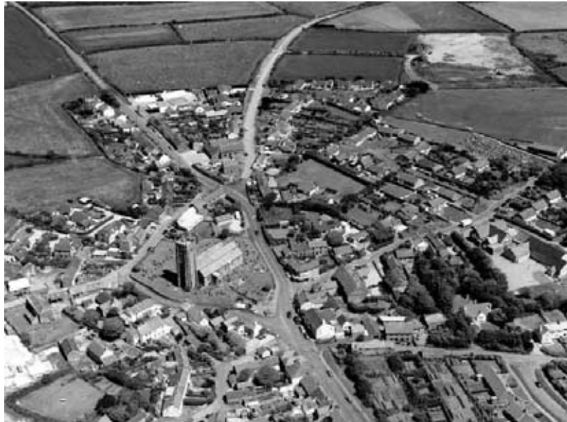
The medieval parish church at St Buryan is on the site of a post-Roman lann, whose enclosure is fossilised in the present-day churchyard. The lann enclosure re-used the line of the enclosing bank and ditch of an Iron Age or Romano-British enclosed settlement.

Post-Roman and early medieval settlements have proved difficult to locate in Cornwall and evidence for everyday rural life is sparse. There was continued occupation in some Cornish rounds; at Trethurgy oval houses were in use into the sixth century after which the round fell into disrepair.