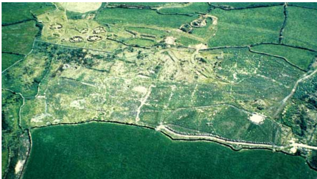
The field system associated with Chysauster courtyard house settlement. Most courtyard houses are situated within extensive field systems arranged like the neat

Most courtyard house settlements are unenclosed although some are found within rounds. Many developed directly from later Iron Age round house settlements; the round houses were incorporated into courtyard houses as rooms. Courtyard house settlements are farming hamlets like the rounds and unenclosed settlements with which they are contemporary.