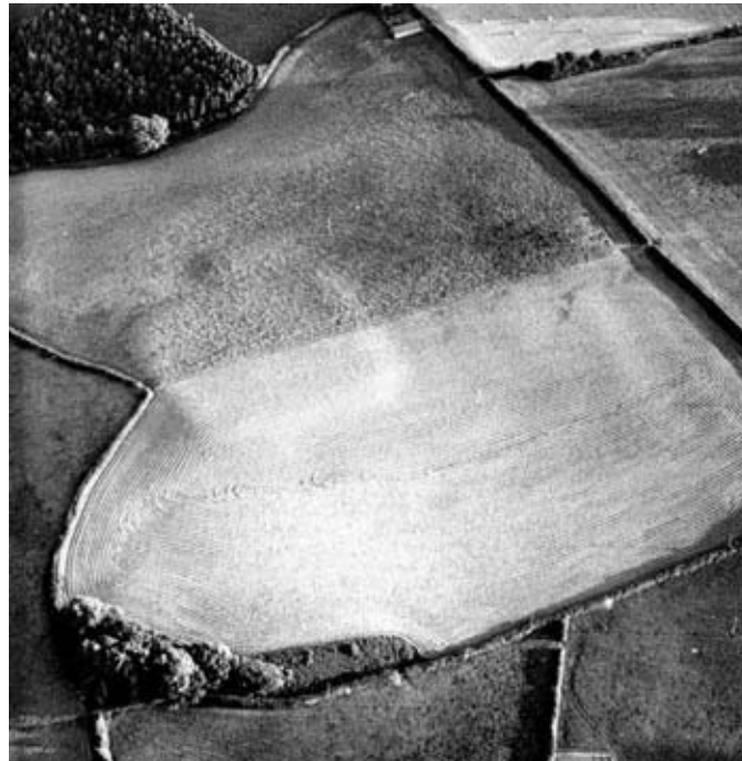
The Roman fort at Restormel surviving as a rectangular earthwork. Only one other fort is known – that at Nanstallon near Bodmin.

The transition from Iron Age to Roman periods in Cornwall is marked by a continuity of lifestyle and tradition. Rounds and enclosed settlements as well as unenclosed round house hamlets continued as the predominant forms of settlement, and there are few signs of Romanisation with only two forts and a single villa.