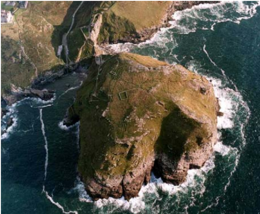
Illustration Tintagel. Tintagel Island. Legend has it that Tintagel was the birth-place of King Arthur. Tintagel was originally thought to be a monastic site but is now generally accepted as the seat of power of the Dark Age kings who ruled Cornwall between the fifth and seventh centuries. There are numerous rectangular buildings from this period on the island and its special status is illustrated by the enormous quantities of imported pottery found there. ©English Heritage. NMR 18251/12

The end of the fourth century AD was a time of repeated upheaval in Britain. The Roman Empire came under ever increasing threat and shortly after AD 400 the armies were withdrawn for the defence of Italy. It is likely that around this time the government of the British province collapsed. From the 440s onwards large areas of Britain were lost to Saxon invaders. In the west, however, there remained a strong sub-Roman enclave whose power against the Saxons is symbolised by the legendary King Arthur.