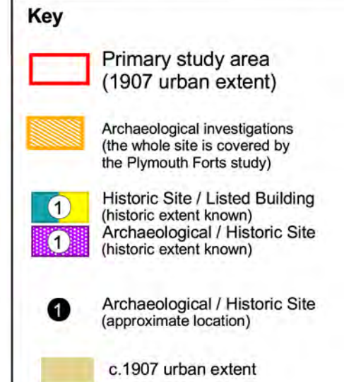
Figure 6. Archaeological potential