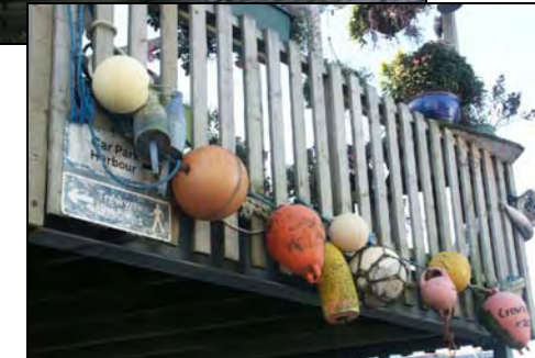
The area contains many guesthouses and hotels and has seaside references.