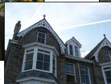
Later terraces feature more lavish and ornate architectural detail.

Front gardens, boundary walls, gates and gate posts are features of some of the terraces.