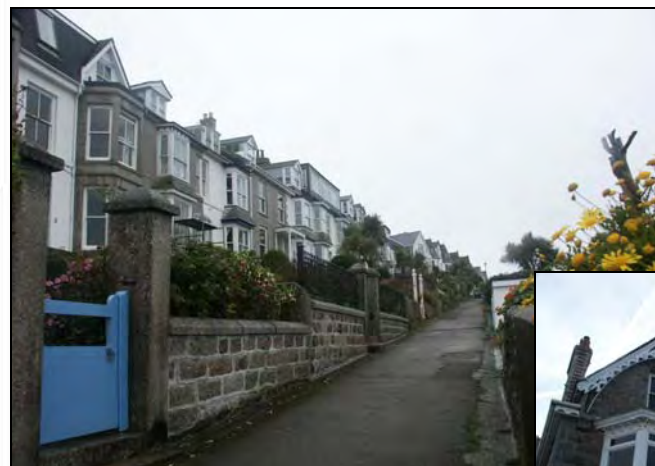
Bay windows, dormer windows, ornate bargeboards and panelled doors are important features of the terraces.

Front gardens, boundary walls, gates and gate posts are features of some of the terraces.