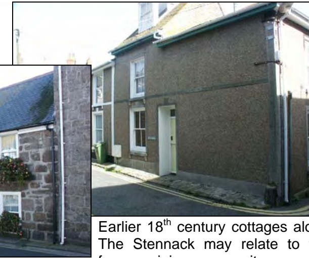
Earlier 18 th century cottages along The Stennack may relate to the former mining community.

Buildings on Street-an-Garrow feature the pebble dash and applied plaster ornamentation seen extensively in the Down'longarea.