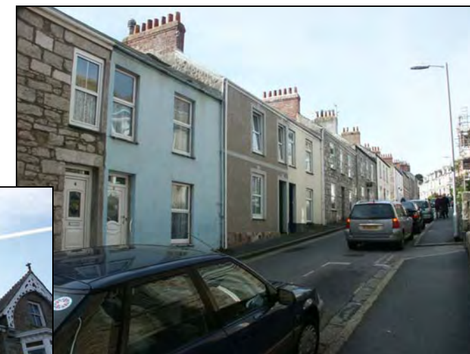
Plainer elevations of Bedford Road properties. Note the importance of the chimneys and stacks to the roofscape.