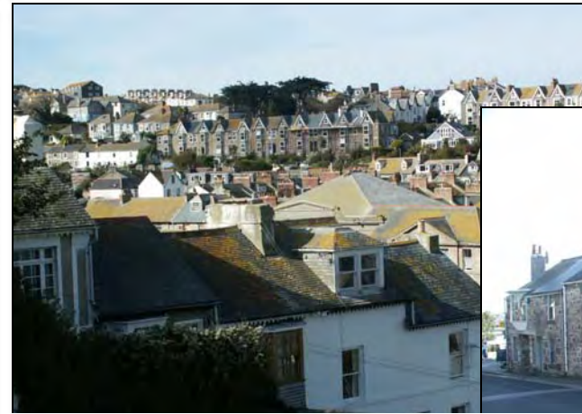
Extensive views across the Stennack Valley and into the old town feature the linear form of the terraces and important green wedges formed by their gardens