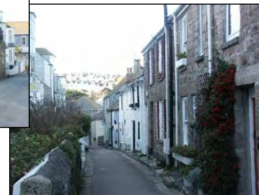
The area around The Warren shares a similar character to the densely packed streets of Down'long