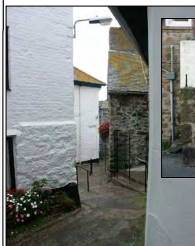
Densely packed maze like development