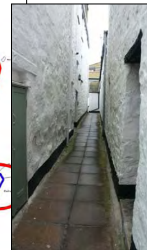
This image shows the importance of the historic surfacing to the character of the area. Its loss has greatly reduced the special character of this alley.