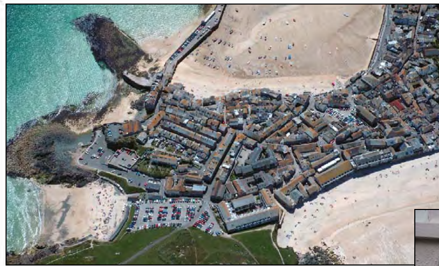
Distinctive urban form, note the 19 th century grid of residential cellars and the large scale of the company cellars near Porthmeor beach