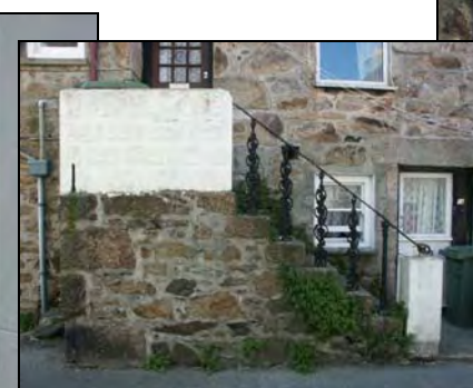
Architectural forms of the area are shaped by their past fishing use. Domestic cellars with external stairs and industrial scaled company cellars form distinctive reminders of this heritage and the fishing community