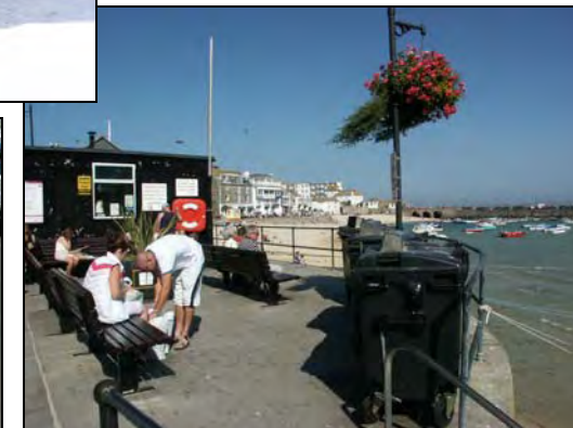
There is potential for enhancement of the area through improvements in the public realm.