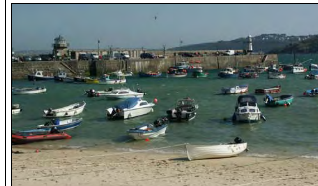
The robust harbour arm and its two lighthouses are important landmark features