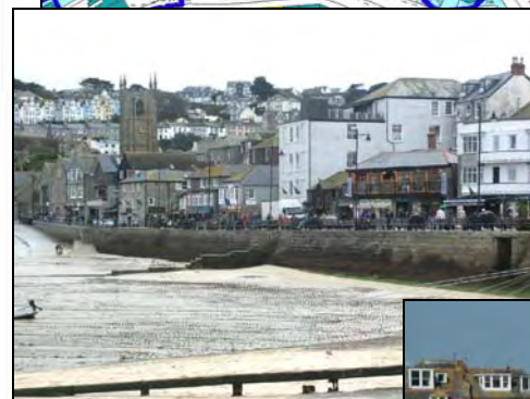
Buildings in the area have greatly changed in character with the addition of added windows, balconies, shop fronts and canopies