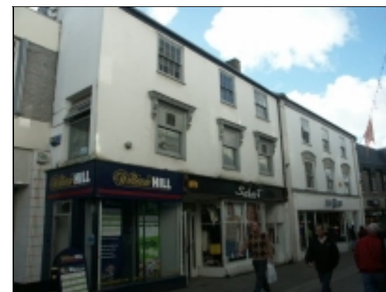
Recognise and enhance quality buildings. Encourage future redevelopment to reassert key elements of the character of the historic streetscape