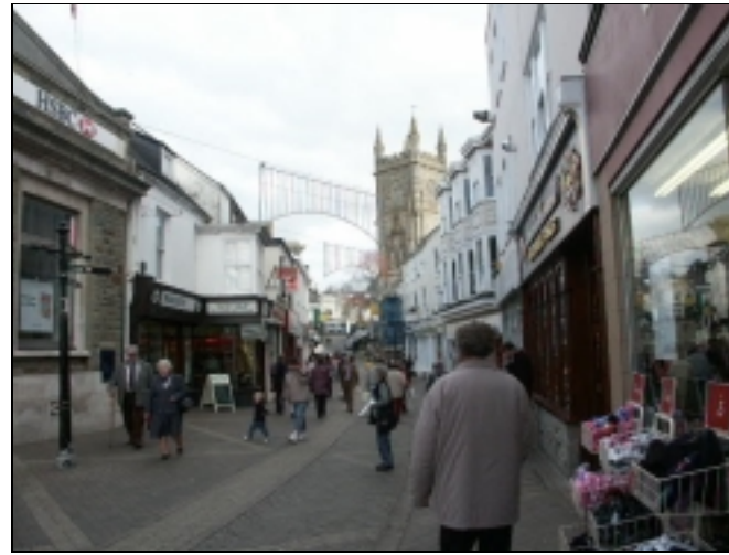
Recognise and enhance the strong urban qualities of Fore Street