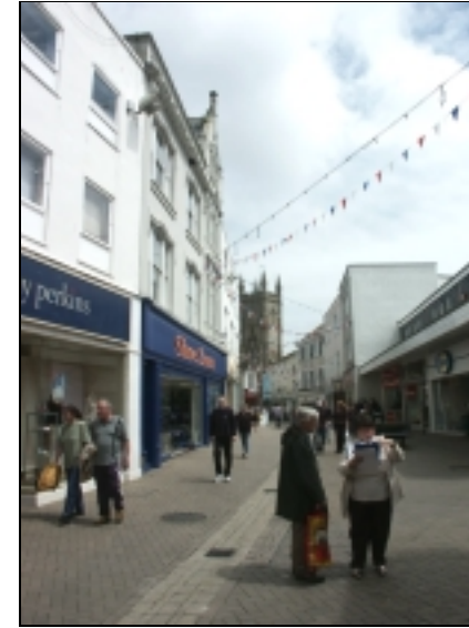
Future development could reinstate urban enclosure by reinstating the building line at street and roof level