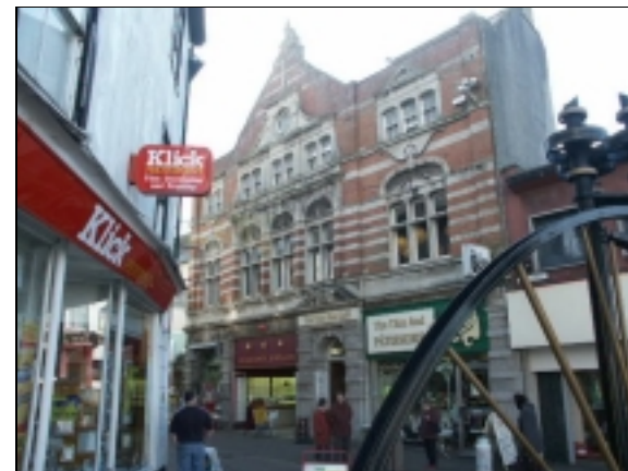
Recognise and enhance quality buildings. Encourage future redevelopment to reassert key elements of the character of the historic streetscape