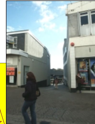
Enhance opes as entrance ways to 'announce' arrival in Fore Street