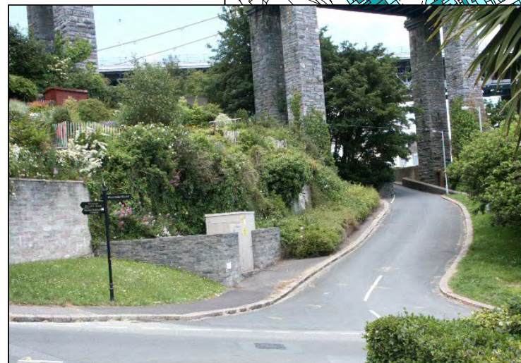
Silver Street could be landscaped or redeveloped