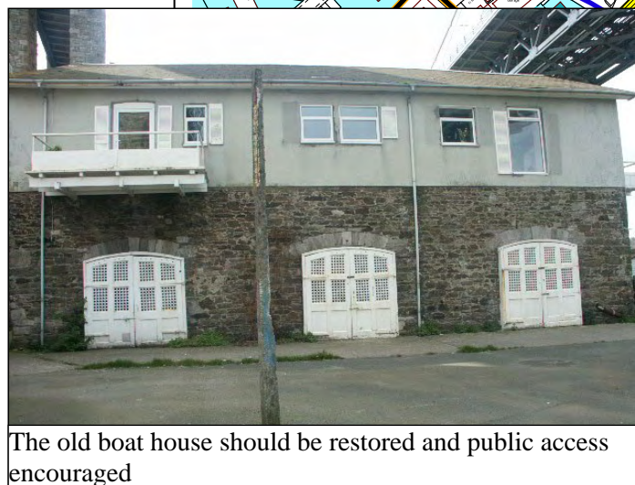
The old boat house should be restored and public access encouraged