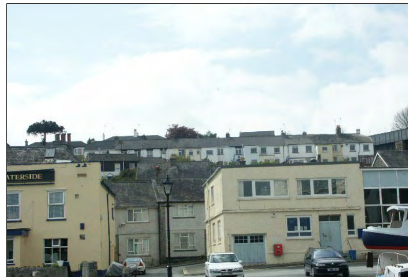
The Saltash Boy's Club (Livewire Youth Project) should be refurbished