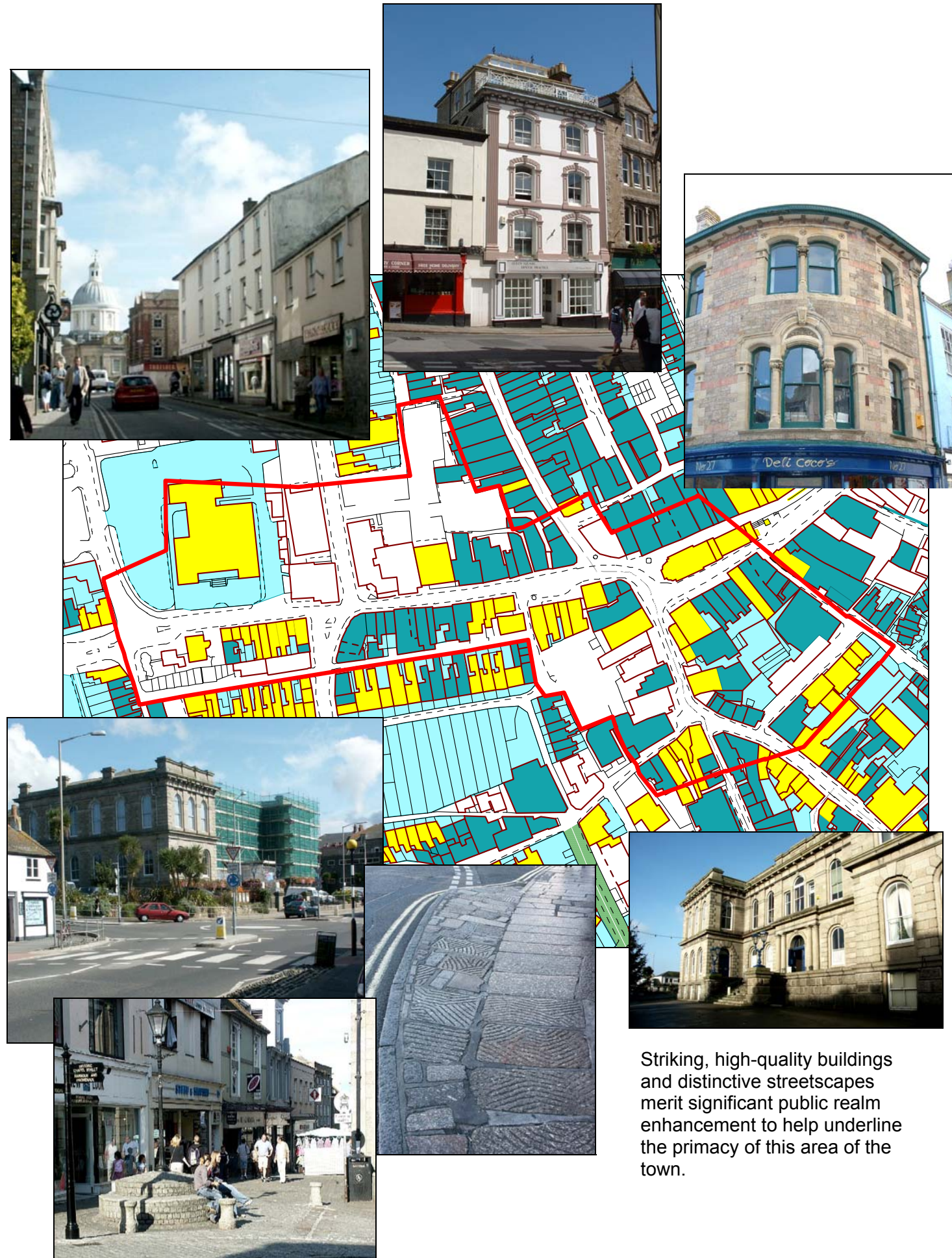
Striking, high-quality buildings and distinctive streetscapes merit significant public realm enhancement to help underline the primacy of this area of the town.