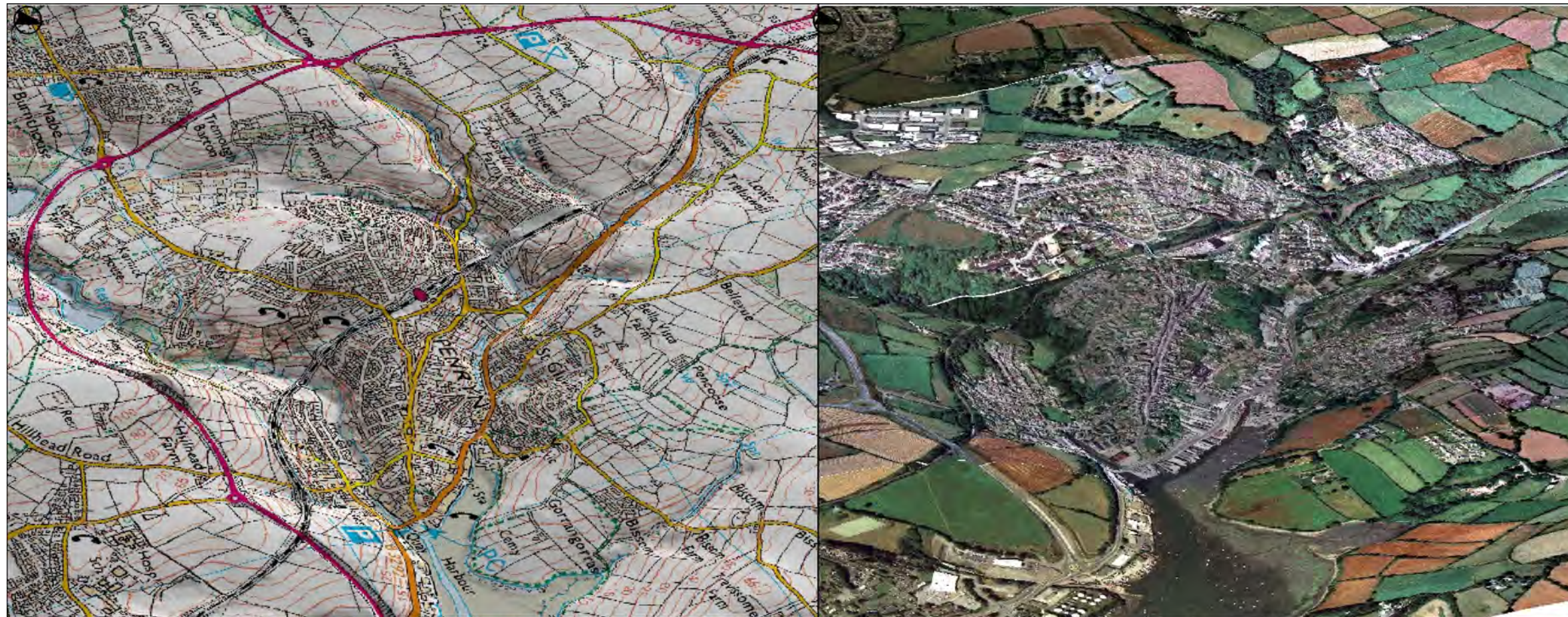
Figure 1. Location & topography