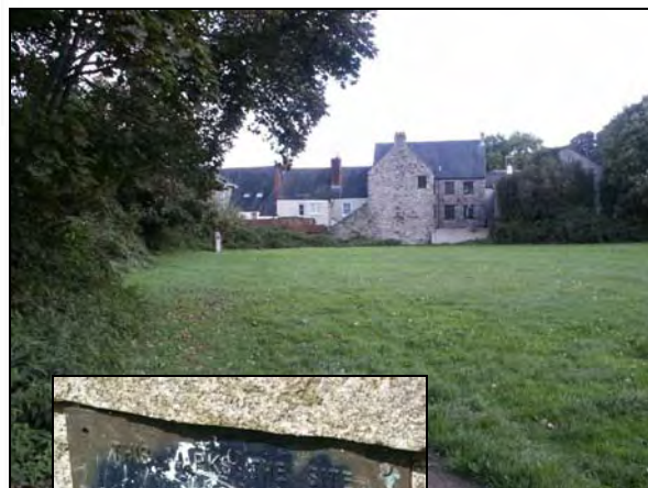
Site of Glasney College. Potential for improved celebration and interpretation of this important site

The Inner Harbour area has absorbed a large amount of residential conversion and new development. The future of a number of historic buildings has been secured as a result