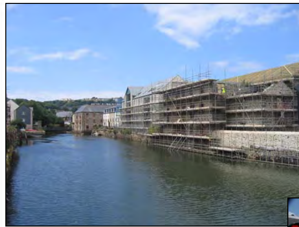
Inner harbour regeneration - Anchor Warehouse conversion