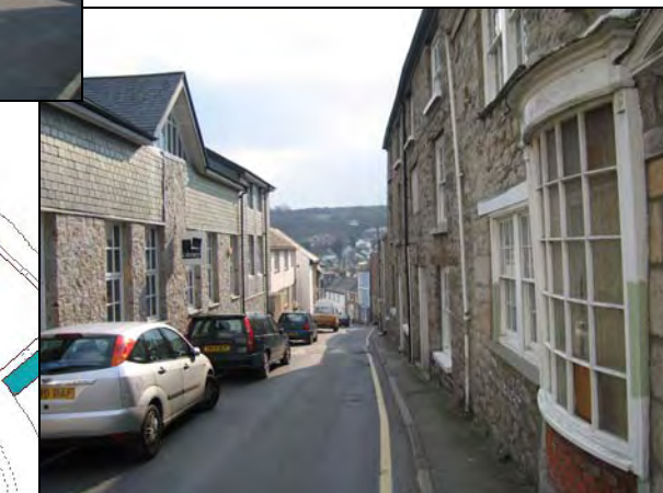
The modern town library, St Thomas Street. A successful new build in an historic setting