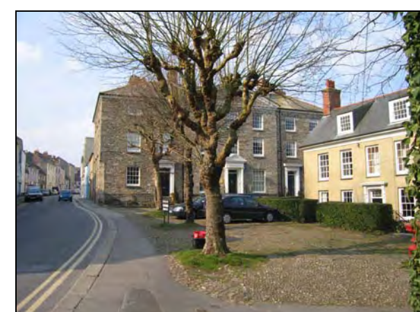
The Square, a semi-formal public space, surrounded by substantial town houses, important cobbled surfacing and pollarded lime trees