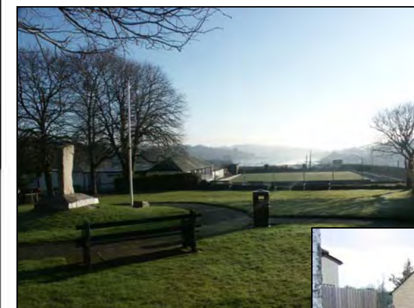
The Memorial Park and adjacent bowling green form important green areas close to the centre of the town