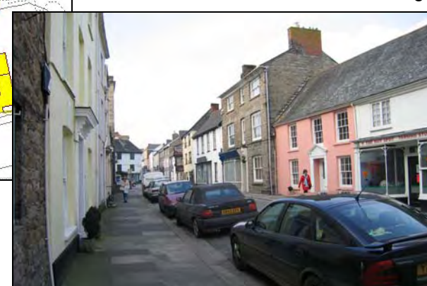
Broad Street, painted stucco facades