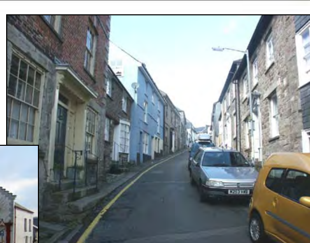
St Thomas Street