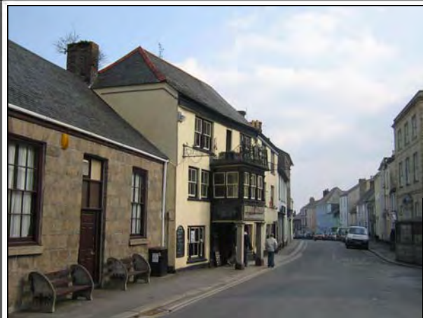
Projecting porch of the King's Arms, a 17 th century building refronted in the mid 19 th century. Plain façade of the Assembly Rooms next door

'Fish Cross', an important town space formed at the junction of a number of roads. Addressed by the elaborate façade of the Old Fire Station