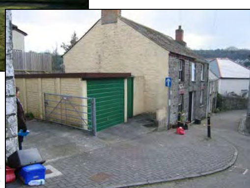
Road signage, herringbone brick built outs and standard bollards erode the special character of some parts of this character area