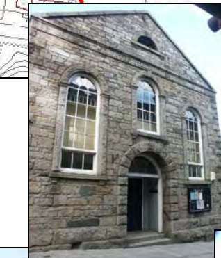
Teetotal Hall, 1852. Impressive granite architecture