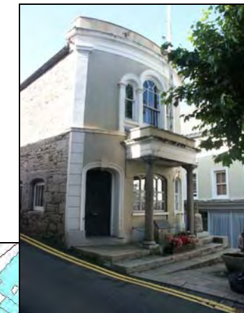
Town Hall and Town Museum. An important landmark building, visible throughout Penryn. Granite windows on side elevations date from the 17 th century. Building extensively remodelled in the 18 th and 19 th centuries.