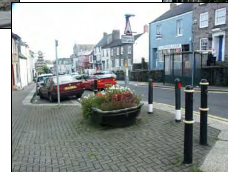
Public areas around the Town Hall are currently under exploited and elements of the streetscape fail to match the high quality of the surrounding historic environment