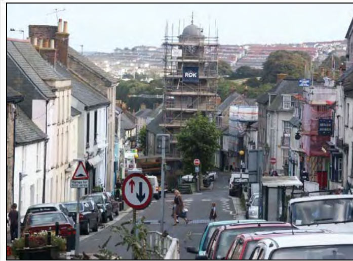
Medieval market place – Upper and Lower Market Streets