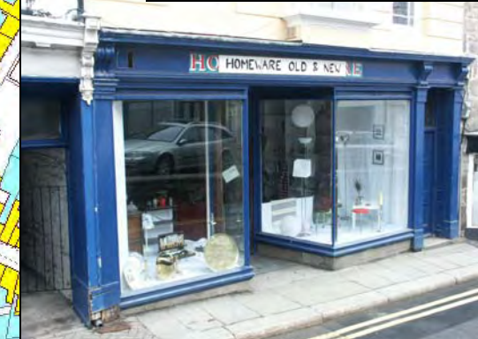
Historic shop fronts of the 18 th century (above) and 19 th century are an important part of the special character of this area