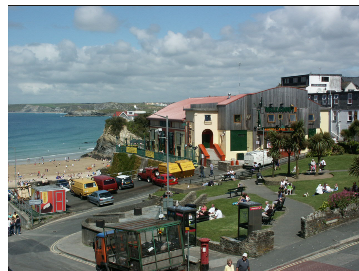
There is potential for enhancement of the promenade area, including the proposed brownfield redevelopment opportunity on the car park site of the lower terrace