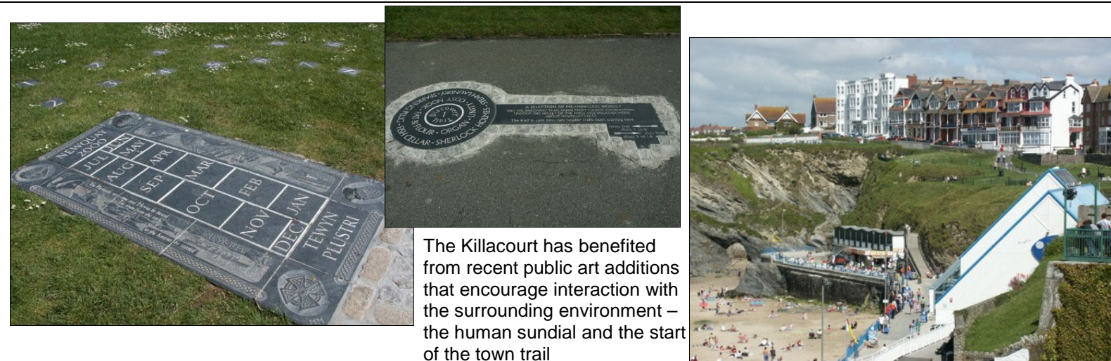
The Killacourt has benefited from recent public art additions that encourage interaction with the surrounding environment – the human sundial and the start of the town trail

Development proposals for a standing wave complex on the lower terrace car park should seek to retain important coastal views.