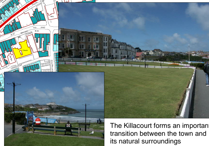
The Killacourt forms an important transition between the town and its natural surroundings