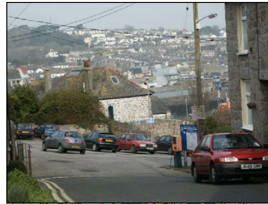
The car park on the area cleared in the 1930s offers a possible future development opportunity, restoring the characteristic high density of settlement in