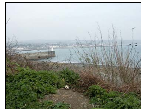
Potential for improvement on the area of derelict land below the road to Mousehole.