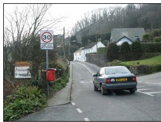
20 th century detached houses and older rural cottages on the southern outskirts of Newlyn.