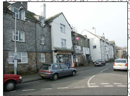
Navy Inn Court: significant use of locally distinctive detailing and materials