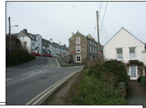
Narrow streets require significant traffic management.