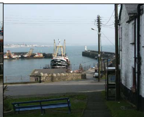
Ship repair facility, the primary working element in this part of the harbour