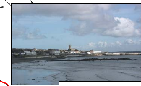
View north west to Penzance