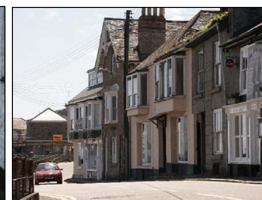
Oriel windows in Fore Street take advantage of striking views over the harbour and beyond