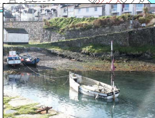
View from Old Quay to Fore Street