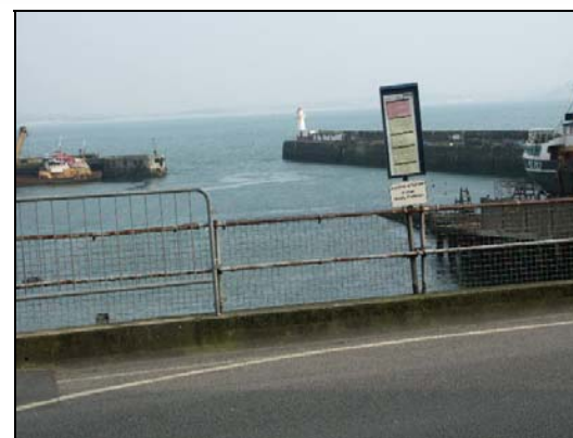
Poor quality public realm, detracting from the high quality natural and built environment.