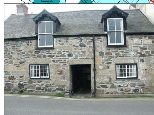
Highly distinctive historic fabric overlooking the quay area