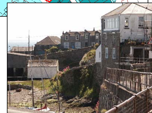
A sharp change in level between Fore Street and the old quay area