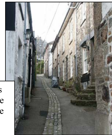
High status architecture side by side with more modest houses in Church