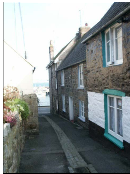
Residential streets run downhill to the harbour.