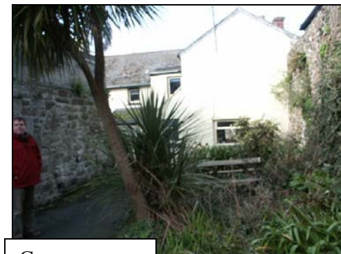
Green space along Rue des Beaux Arts, a ‘gear’ which links the steeply sloping main