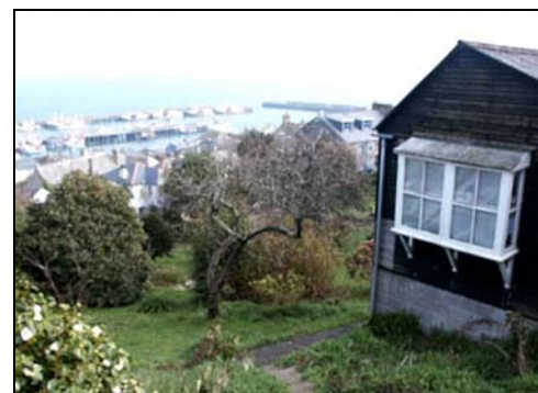
Studio, gardens and view from Orchard Cottage: an important green element and artist's inspiration