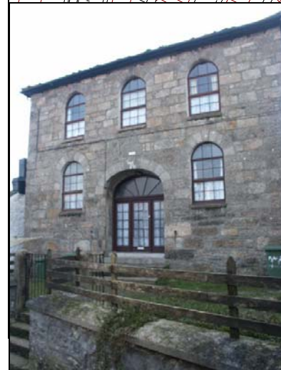
The Ebenezer Chapel – an important building in Boase Street.