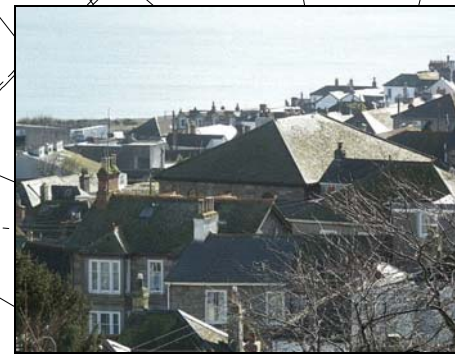
Roofscares and striking views to the harbour are a key element of the area’s character