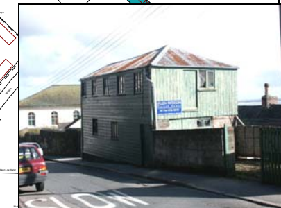
A timber clad carpenter’s workshop on Chywoone Hill – an unusual survival.