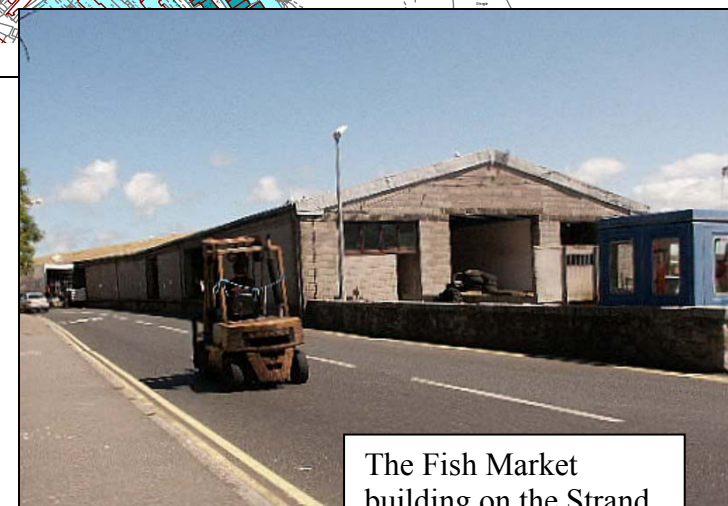
The Fish Market building on the Strand