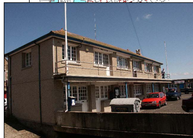
The 1930s Harbour Commissioners' offices in a commanding position at the harbour head.