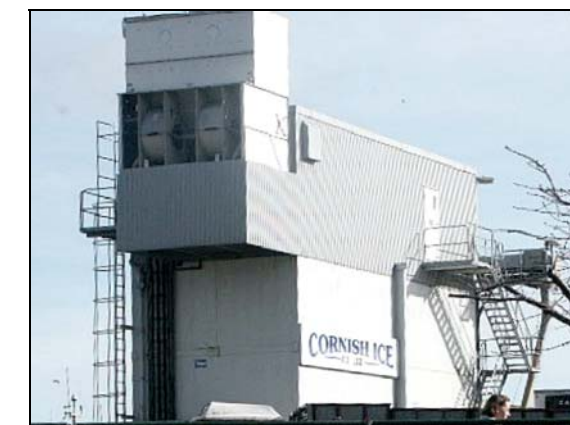
Function as design: the new ice works on the quayside.