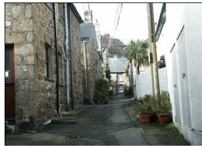
Orchard Place; the 'court' form is characteristic of the area.