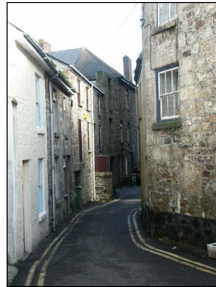
The Fradgan: narrow, sinuous and highly enclosed streets.