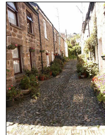
Distinctive housing and surfacing.