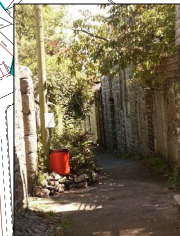
Foundry Lane is an important local pedestrian route.