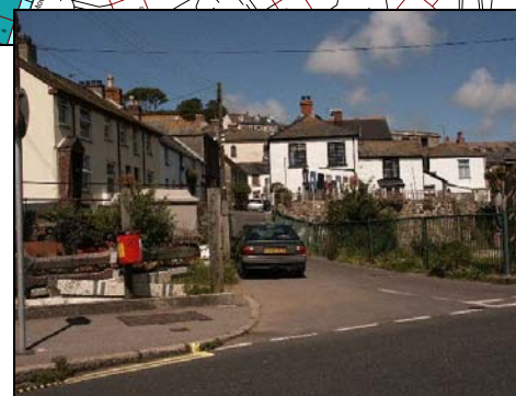
View to Fradgan Place along Gwavas Quay.