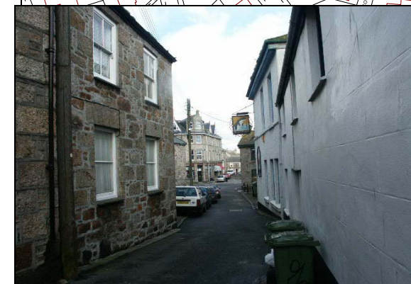
Jack Lane looking towards the Newlyn Bridge junction.