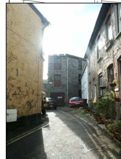
Warehouse building in Fradgan Place.