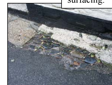
Partially covered original surfacing.