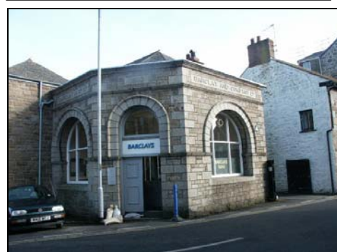
Barclays Bank: fine stonework and distinctive single-storey design.