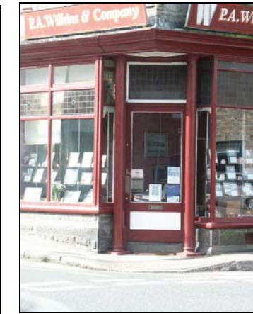
Detail of shop front and corner door.