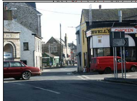
View from the Coombe towards the harbour from Newlyn Bridge junction.