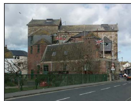
The ice works on the Strand, a key building in the area and highly visible from other areas.