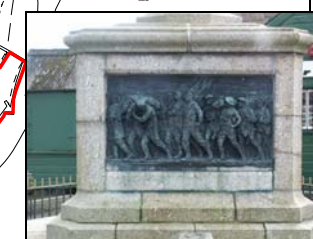
Newlyn copper work on the war memorial in front of the Fishermen's Mission