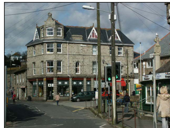
Dominant commercial building, part of the new urban development after the opening of the enlarged harbour.