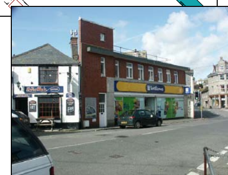
Future redevelopment should aim to enhance the distinctive character of the area.