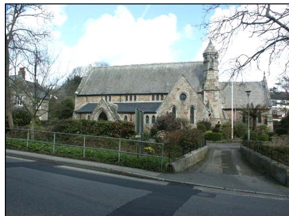
St Peter's Church, on the east bank of the Newlyn River, accessed by a bridge.