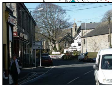
View up the Coombe from Newlyn Bridge junction.