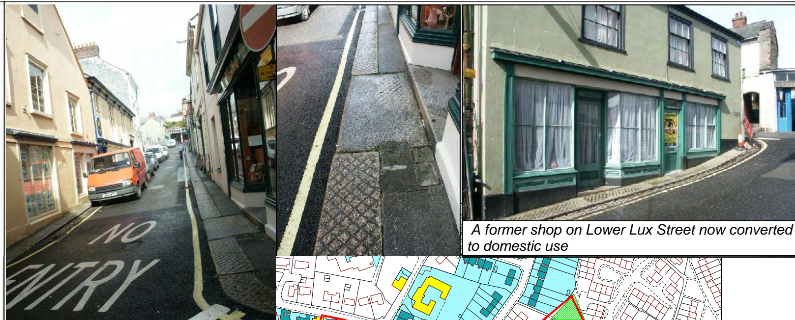
A former shop on Lower Lux Street now converted to domestic use