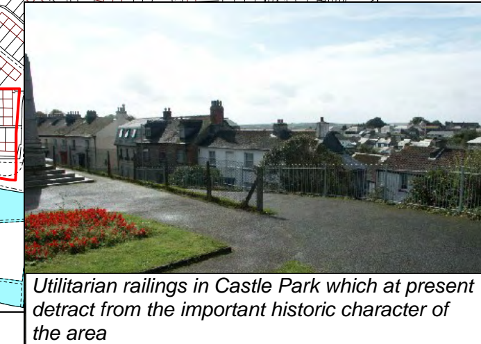
Utilitarian railings in Castle Park which at present detract from the important historic character of the area