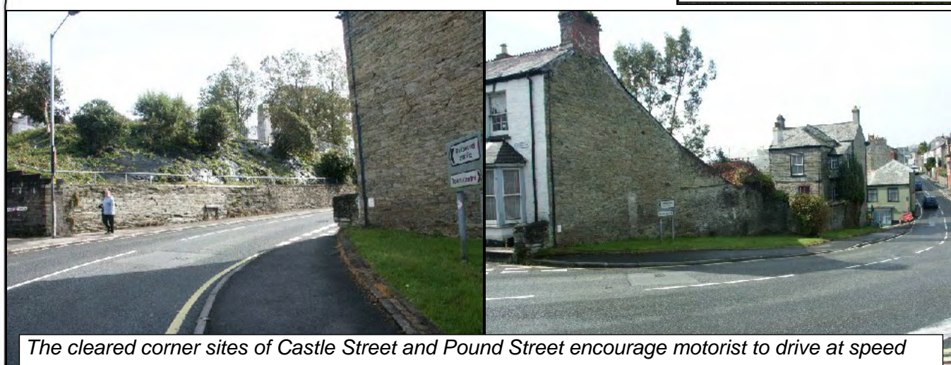
The cleared corner sites of Castle Street and Pound Street encourage motorist to drive at speed