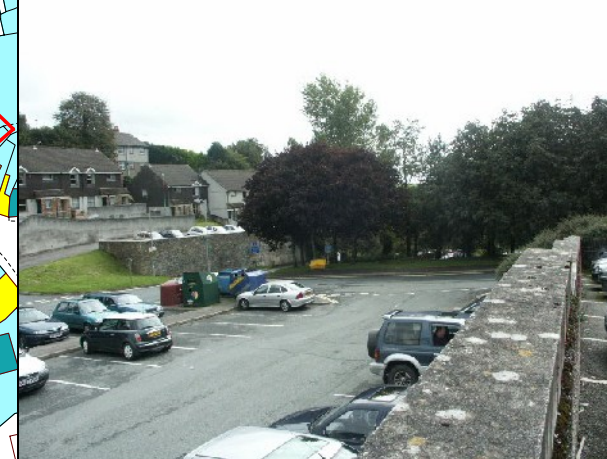
The Sun Girt area currently under utilised as a car park