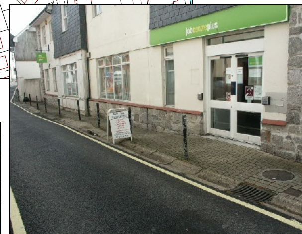
Poor quality forecourts off Market Street and Church Street