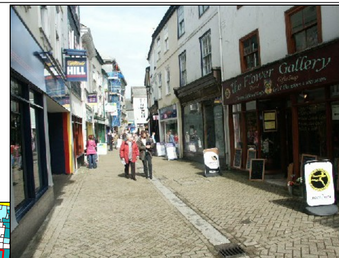
Some of the upper floors of shops are at present underused