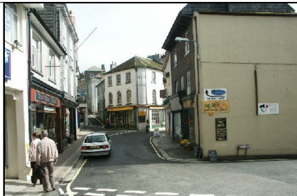
The site of the medieval market place