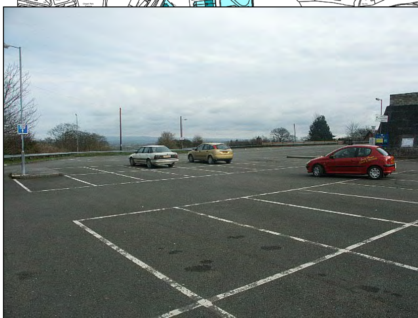
Race Hill car park could be re-landscaped to make it more visitor friendly.

CCC licence No. 10019590. All material copyright © Cornwall County Council 2005.