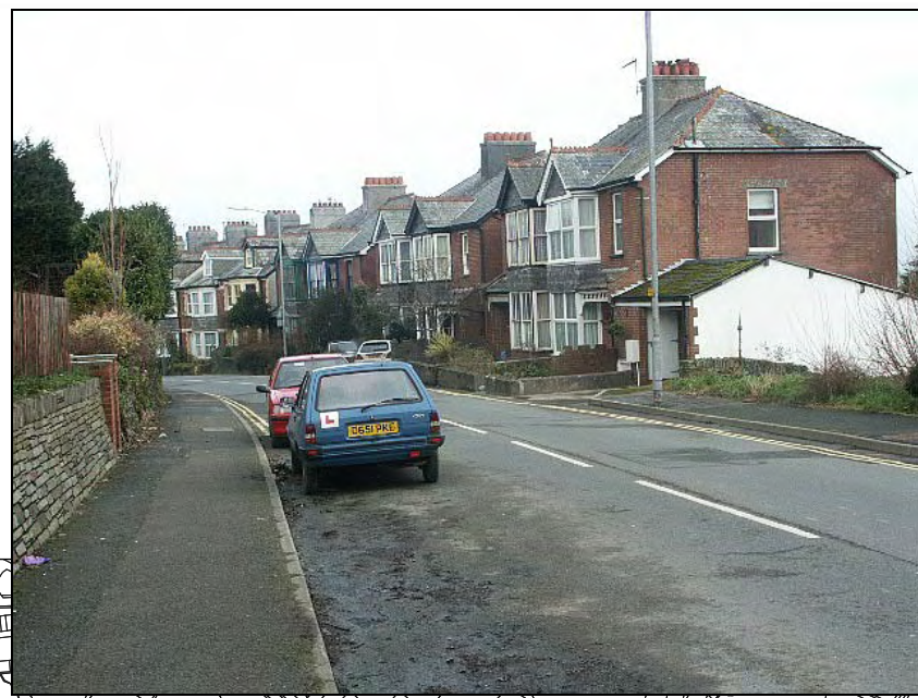
Villas along Tavistock Road.