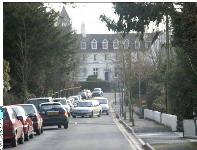
Launceston College from Dunheved Road