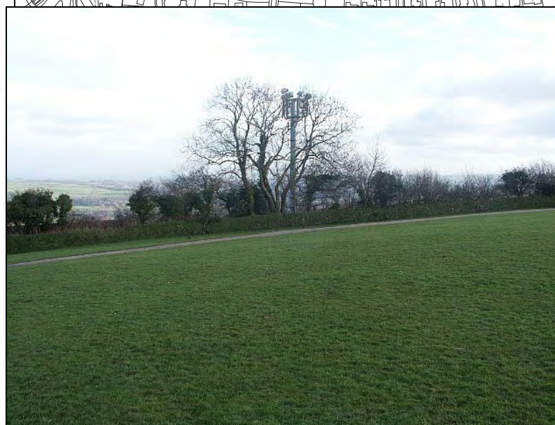
Views into Devon from the highest point at Windmill.