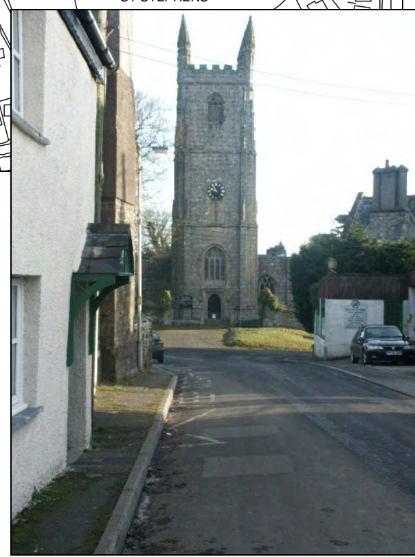
Looking down Duke Street to St Stephen's church.

CCC licence No. 10019590. All material copyright © Cornwall County Council 2005.