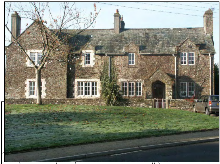
Estate cottages on the green at St Stephens.