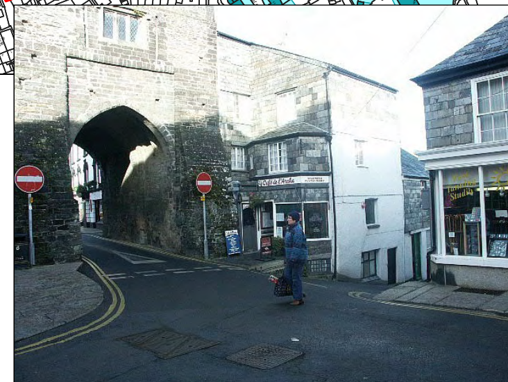
The medieval Southgate, a scheduled monument