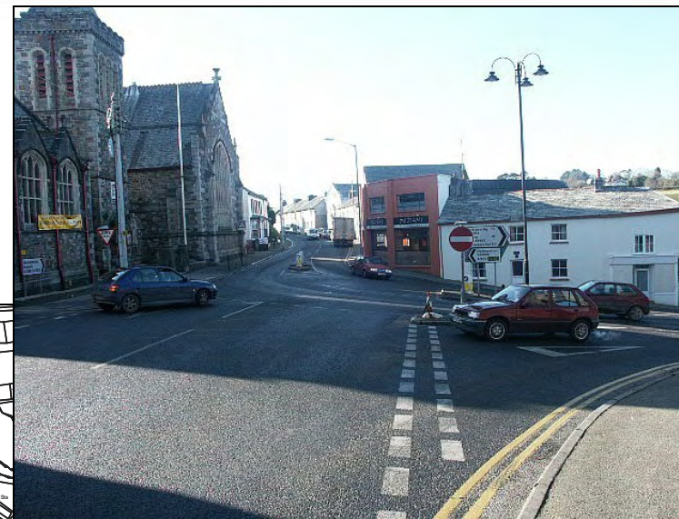
The difficult traffic junction in front of the Guildhall.