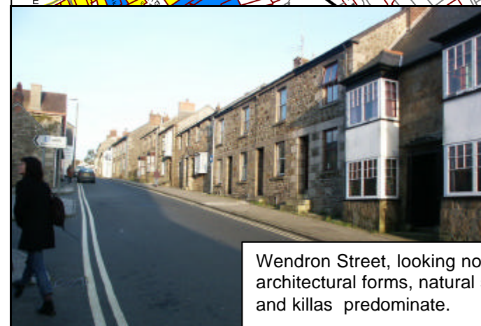
Wendron Street, looking north east. Modest domestic architectural forms, natural stone colours of granite and killas predominate.