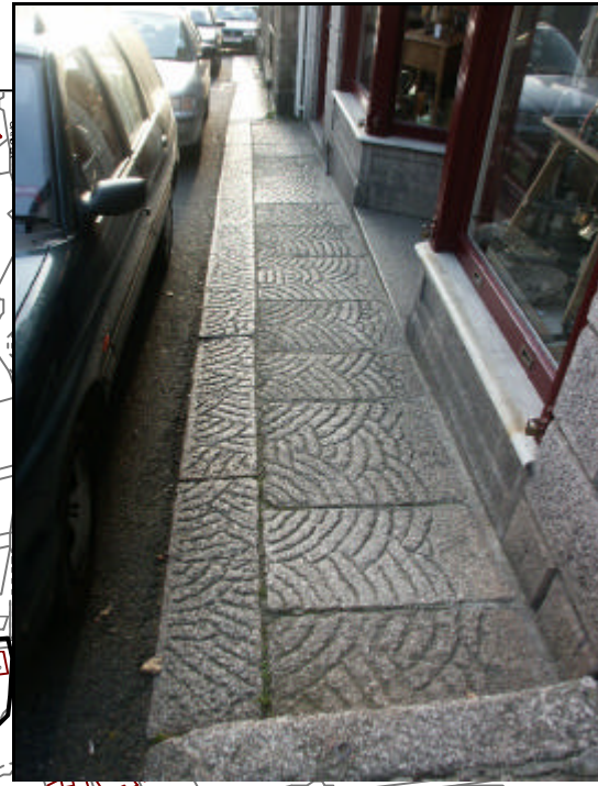
Narrow pavement and distinctive fan-scored granite surfacing at the south-west end of Wendron Street.