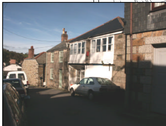
Former tannery – Lady Street, showing local construction materials and uses.

The well head on Five Wells lane: opportunities for repair and maintenance to the well basin, the boundary slate-topped walls and the railings. Inset: similar capped walls and the date stone in the well head.