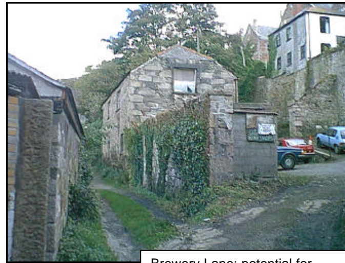
Brewery Lane: potential for repair and new uses for a significant historic building and yard.