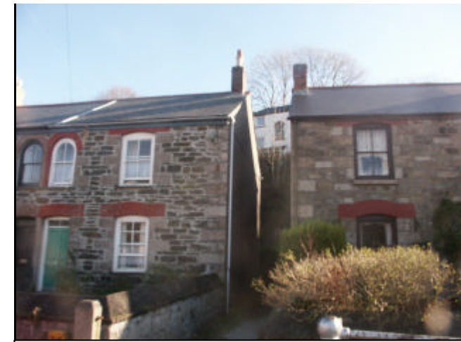
Castle Green terraced cottages. Typical building materials and features.