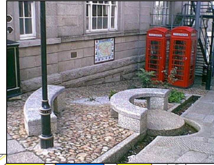
The lane east of the Guildhall: modern 'locally distinctive' granite seating and a water feature located in a valuable pedestrian 'refuge'.