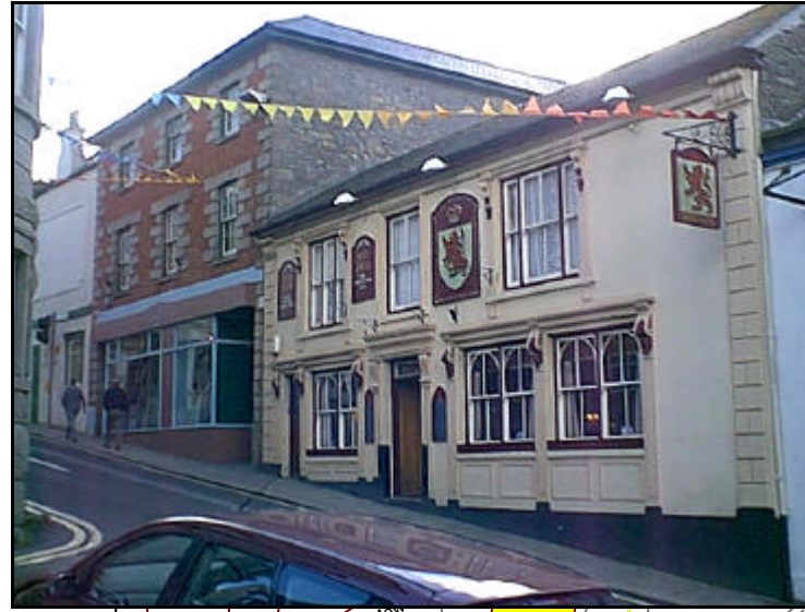
Buildings on the west side of Market Place. Diverse architectural forms and materials and the sloping topography contribute to the character of the area.