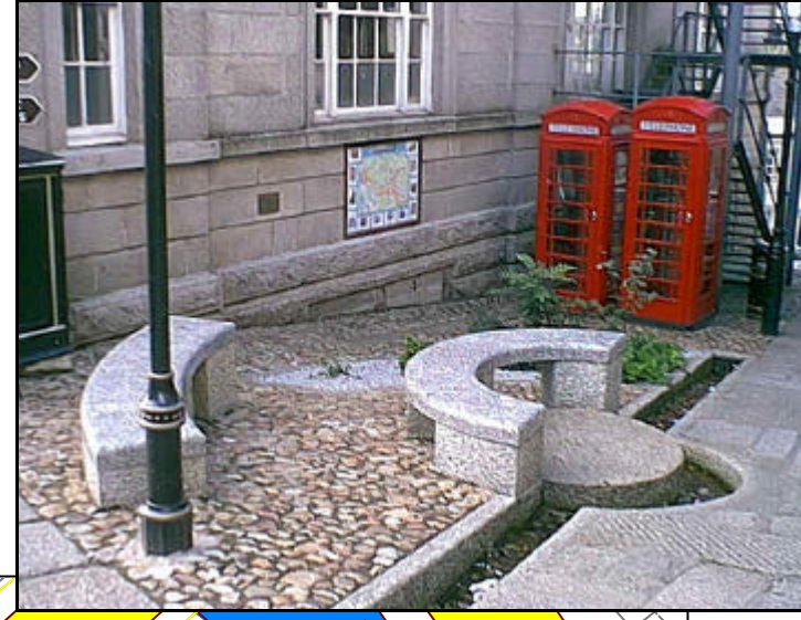
The lane east of the Guildhall: modern 'locally distinctive' granite seating and a water feature located in a valuable pedestrian 'refuge'.