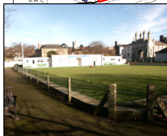
The Bowling Green – an important historic site. Potential for substantial public realm improvements.