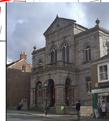
Methodist Chapel, Coinagehall Street: a landmark building. Potential to reinstate railings.