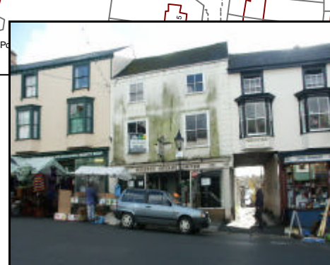
Helston Arcade – potential for a sensitive repair scheme, enhancing the streetscape and increasing occupancy and activity.