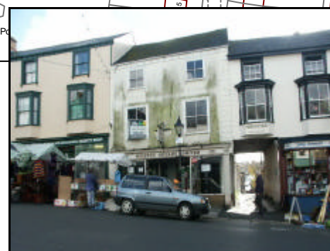
Helston Arcade – potential for a sensitive repair scheme, enhancing the streetscape and increasing occupancy and activity.