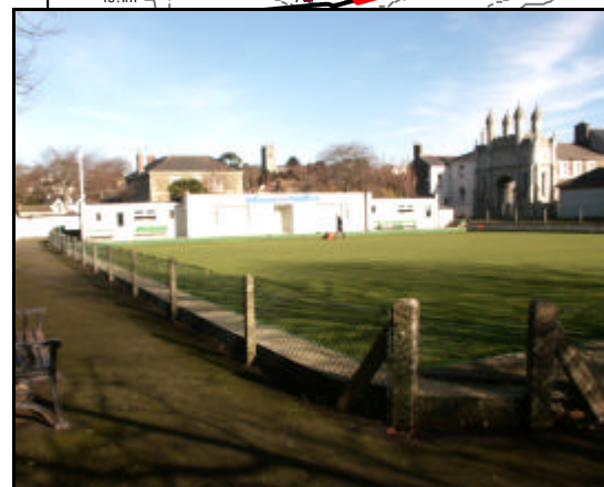
The Bowling Green – an important historic site. Potential for substantial public realm improvements.