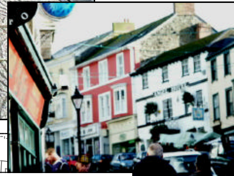
The steeply-sloping Coinagehall Street – imposing buildings and vibrant colours.