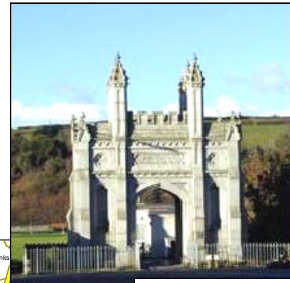
The Grylls monument – focal point of views west along Coinagehall Street - and spectacular views to countryside.