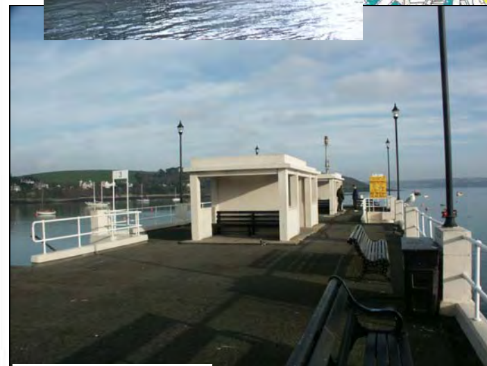
Prince of Wales pier