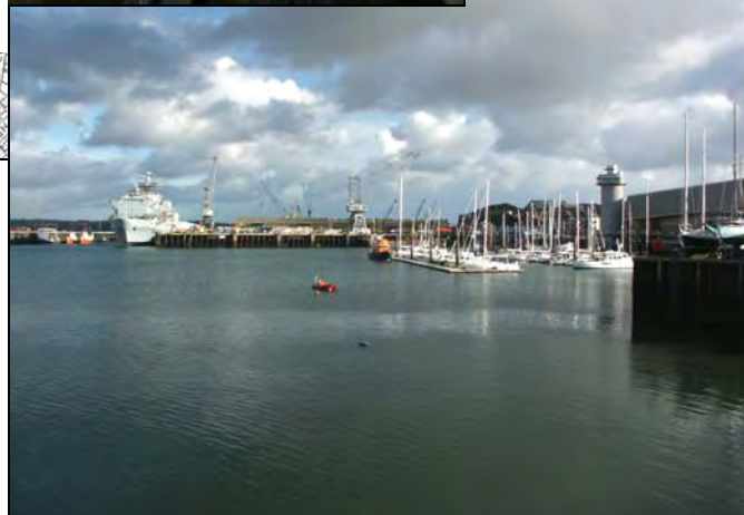
View to Falmouth Docks and National Maritime Museum