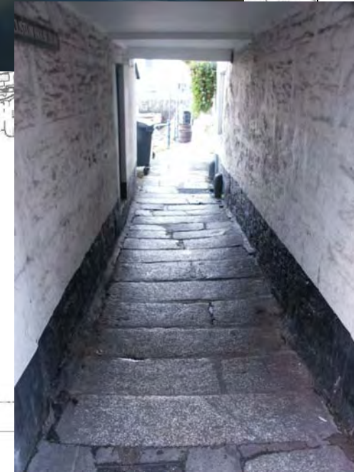
Open and paving, North Quay