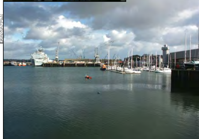
View to Falmouth Docks and National Maritime Museum