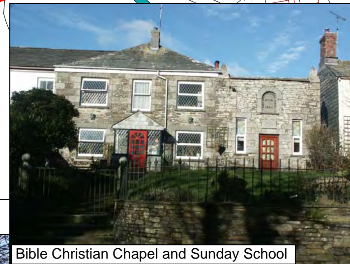
Bible Christian Chapel and Sunday School