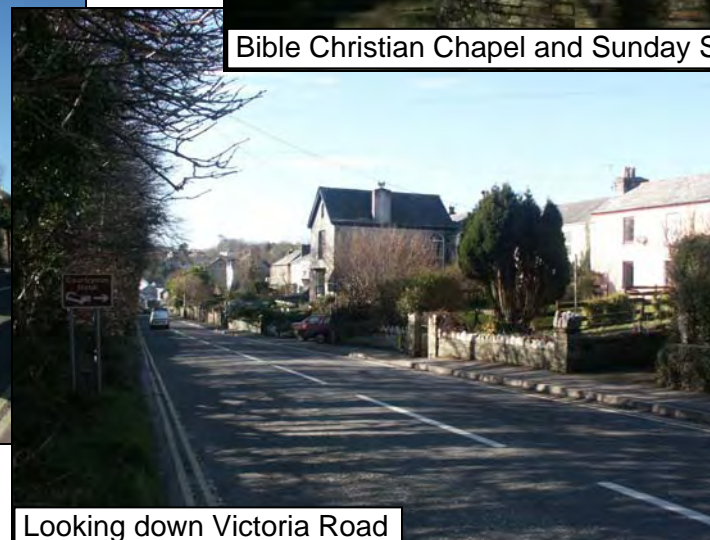
Looking down Victoria Road