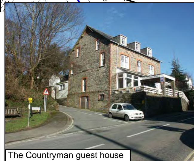
The Countryman guest house