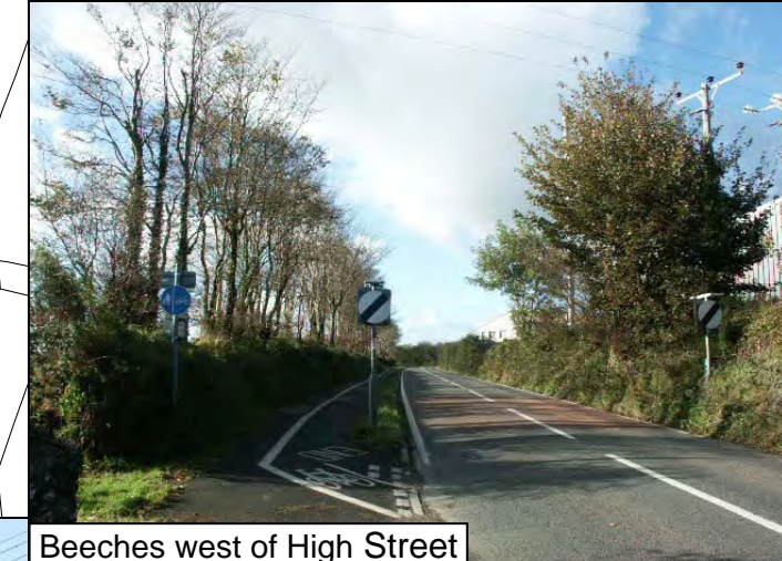
Beeches west of High Street