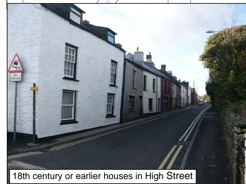
18th century or earlier houses in High Street