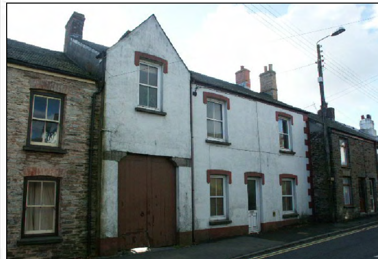
Variety of cottages and carriage houses