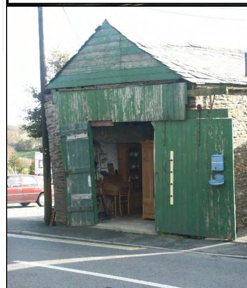
Former coach house in High Street