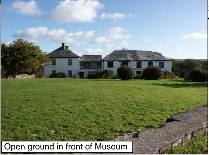
Open ground in front of Museum