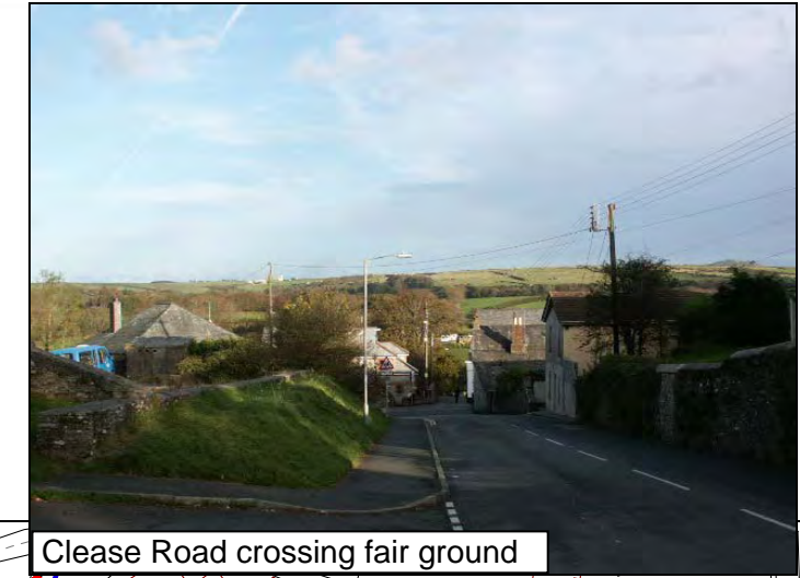
Cleave Road crossing fair ground