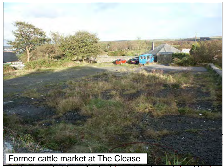
Former cattle market at The Cleave