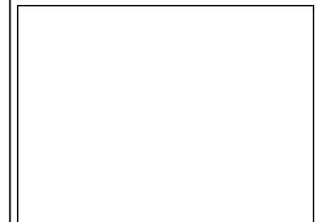
Photographs, clockwise from top left: Berry Tower and cross; Tower Hill (Church Lane); houses on Rhind Street; Tower Hill farmhouse; meadow plot on Rhind Street; East Cornwall Hospital; view down Castle Street.

CCC licence No. 10019590. All material copyright © Cornwall County Council 2005.