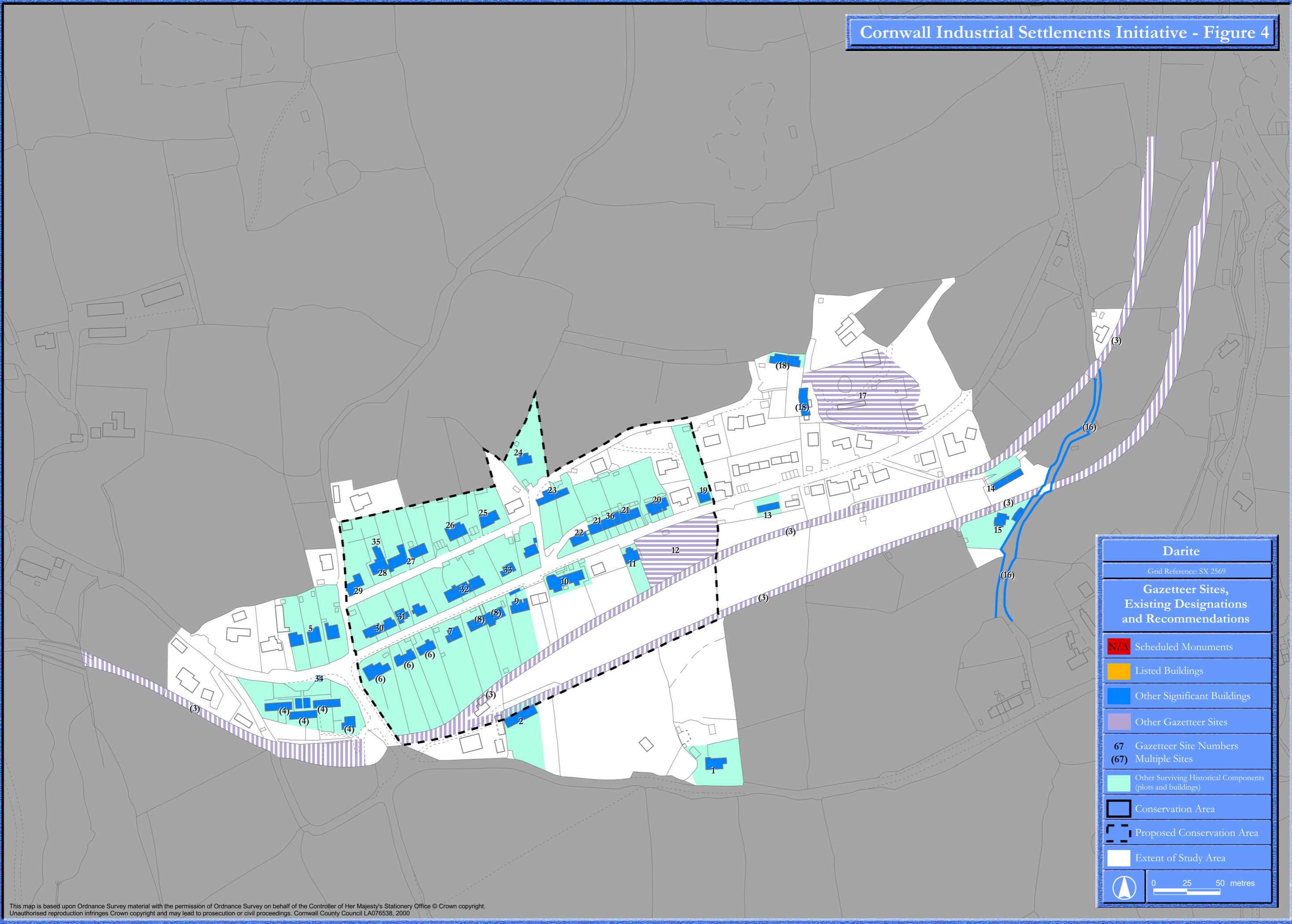
Cornwall Industrial Settlements Initiative - Figure 4